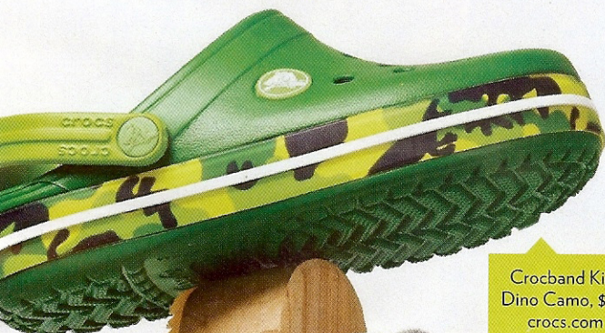
Crocband Kids Dino Camo, $30; crocs.com

Clogs made a comeback last year for women, and now they're for tinier toes. If you get a pair for your child, look for a style that has a closed heel or a back strap to make sure her feet stay securely in the shoes.