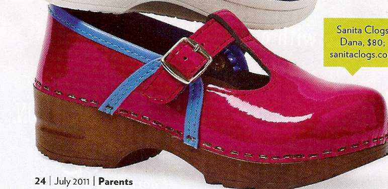
Sanita Clogs Dana, $80; sanitaclogs.com