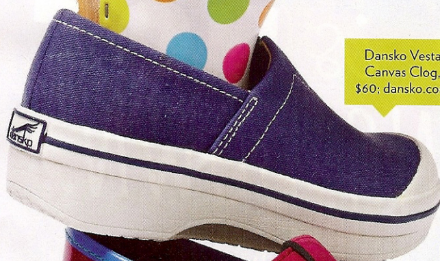
Dansko Vesta Canvas Clog, $60; dansko.com