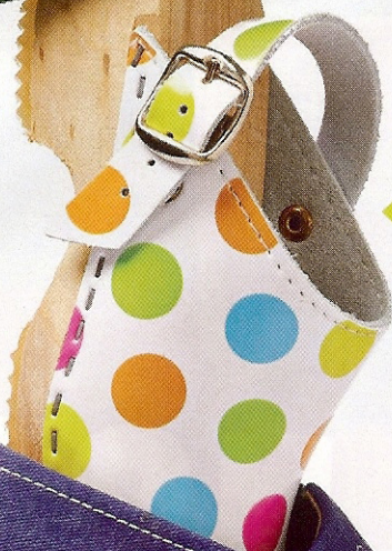
Cape Clogs Dots, $50; capeclogs.com